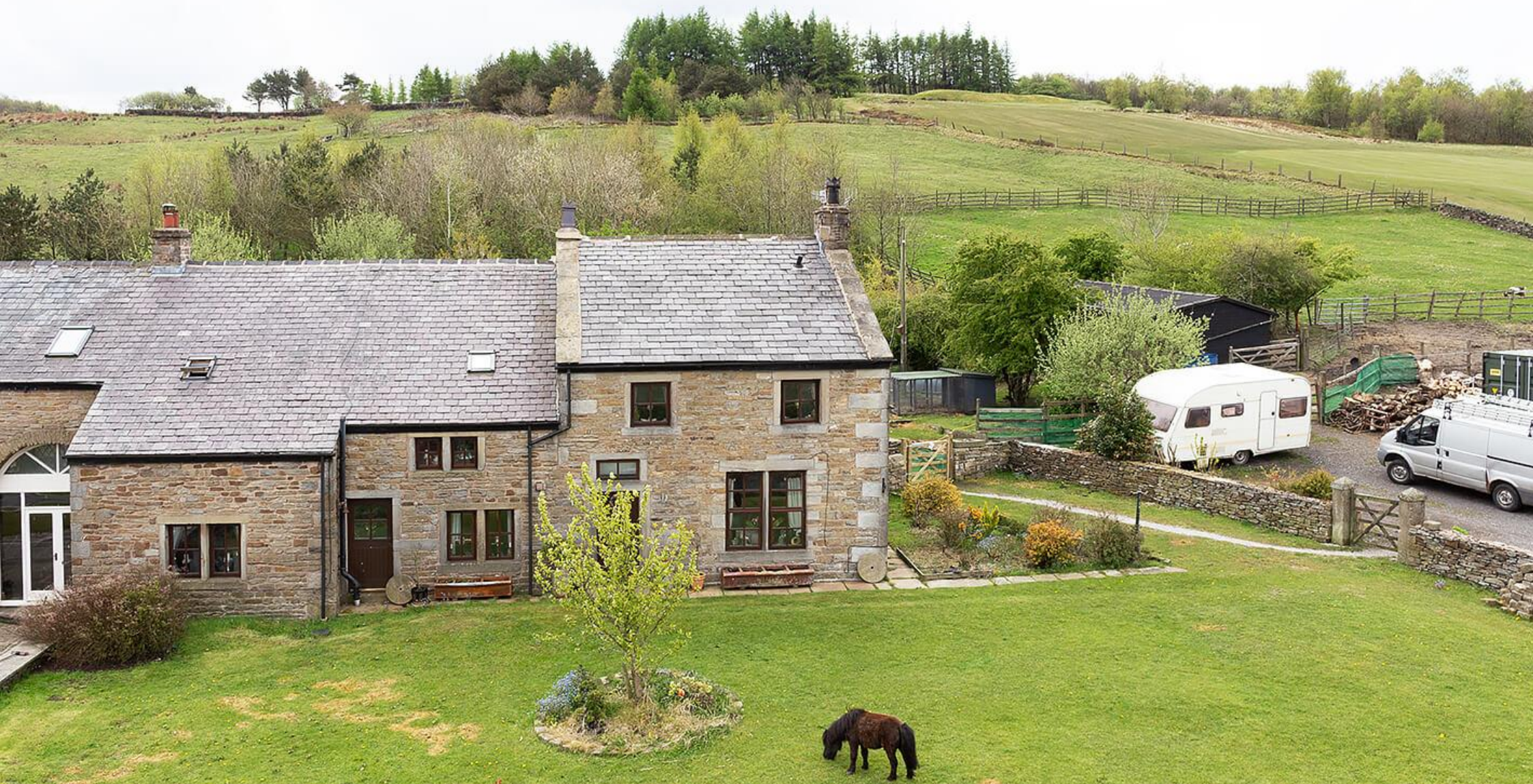
Hollin Cross Farm Woodplumpton Road, Burnley